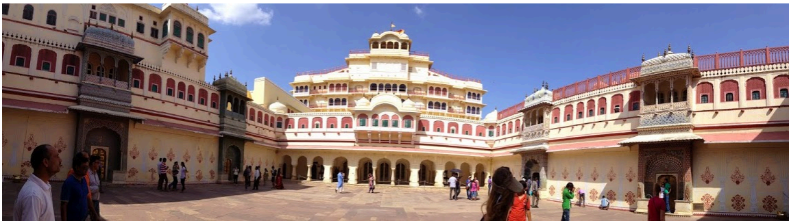
Jaipur City Palace

and back to the “real stuff”. The City Palace was an architectural wonder - pink walls, elaborate courtyards, sandstone pillars, majestic gates, carved elephants and enormous silver urns. A group was worshipping in a make-shift Hindu temple in the pavilion by the silver urns - a couple harmoniums were playing while some men were performing pujas and women were applying henna on their hands. The harmonium reminded me of Rossini’s Petite Messe Solennelle that we were going to be performing back in CA in a few weeks - I had been studying the music on my iPad in India, and I was looking forward to performing it along with 2 pianos (the famous Jon Nakamatsu on one), and a harmonium. The sound of the harmonium in an Italian mass was like having the sitar in some of the later Beatles works.