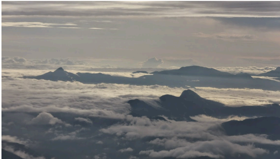
En route to the north

We were at the airport early - not wanting to risk any misadventures on the roads or at the airport, we took the extra caution. Nisha and her dad said good-bye for now - it was bittersweet, but I was looking forward to the sights around Delhi. The gate wasn't open yet when I arrived (the counters opened 2 hours early), but everything was running on time, and the logistics actually appeared to run like clockwork. 40 rupees for a coffee and a pastry kept me going for a little while.