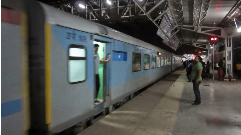
Our train arriving