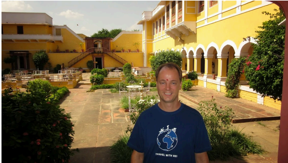
Courtyard of our palace

had me anticipating a giant roast suckling pig with an apple in its mouth or something similar on a kingly platter. It didn't bother me too much though - I was actually thinking more about how much time we would have to explore the vast grounds of the palace. Seeing that it was mostly empty, I wondered what we would be able to peek into.