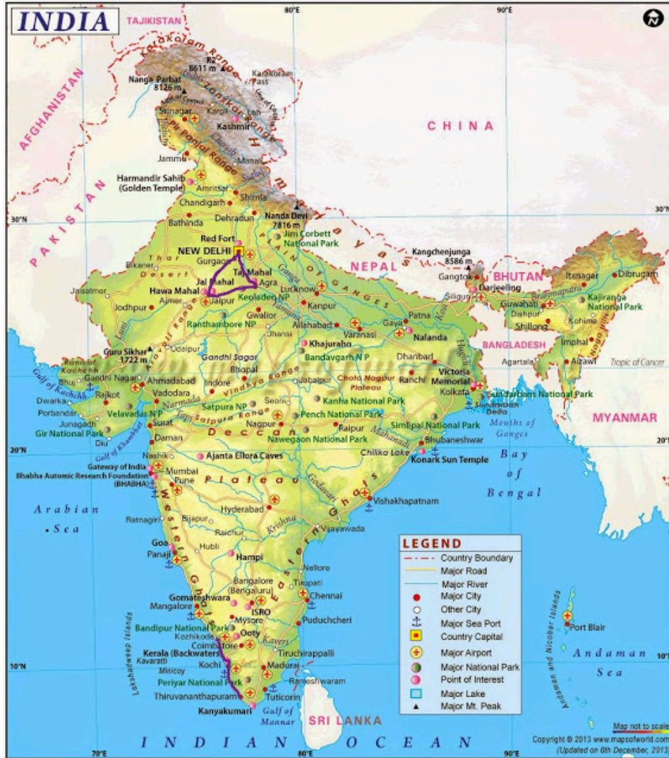
Our route in purple - there was so much to see...