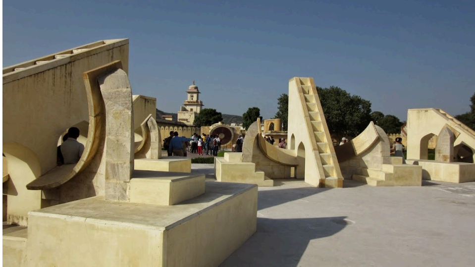
Signs of the zodiac