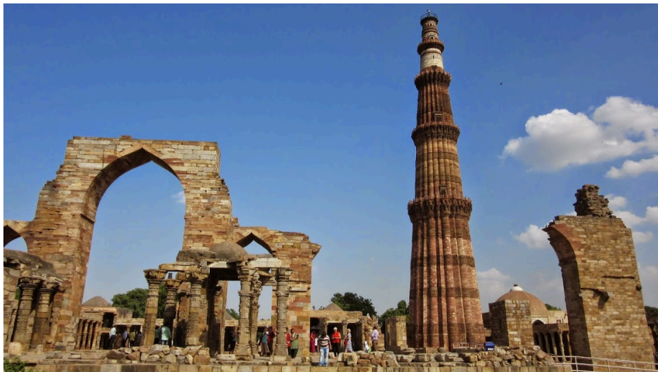
Qutb Minar complex