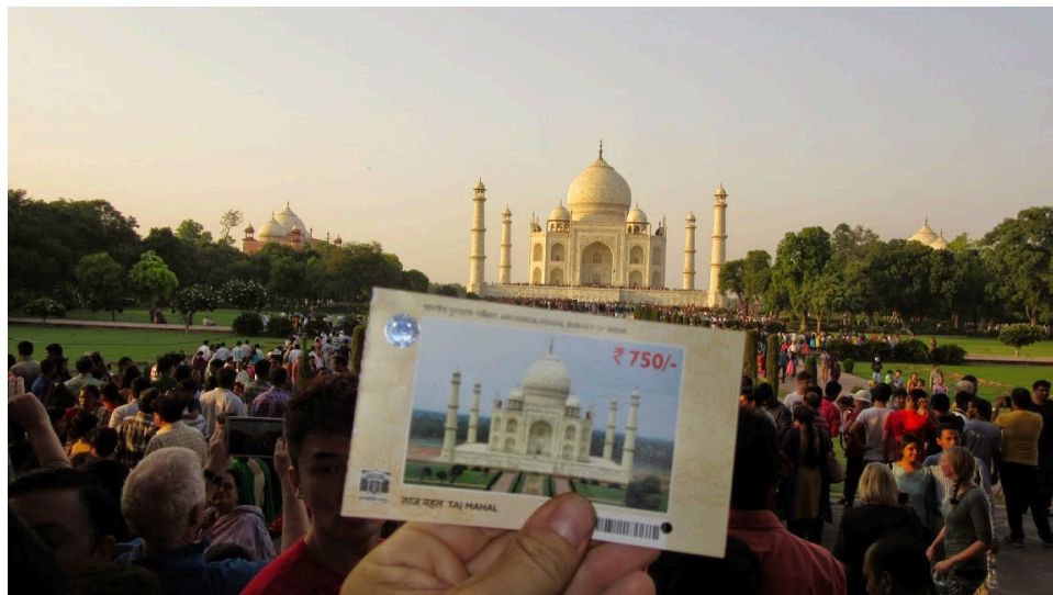
It matches my ticket!

A deep red-orange sun was setting over one of the small pavilion domes next to one of the enormous minarets. Visible through the columns of the pavilion, it made the dome appear as if it housed a magical glowing red orb. The main gate was just ahead, clad with a verse from the Koran written in elegant large pishtaq-styled Arabic writing - translated to English it means "O Soul, thou art at rest. Return to the Lord at peace with Him, and He at peace with you". The writing itself was a work of art. In Islam, they don't believe in idols or icons for worship - no statues, gold-plated elephants or bull statues, so the experience of worship seemed very "clean" and uncluttered, especially compared to the over-the-top experience at the Hindu temple earlier.