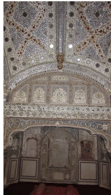
Inside the abandoned palace

If something like this were in the US, I'm sure it would have been closed years ago, until the authorities made it into a museum, only available by docent-led tours. Here, we would explore at will, wandering the grounds. Of course I had no idea really where to go - following our guide was the best option after all. Opening of the doors across the courtyard, we came to a giant sitting-room, clad with bright red carpet, ornately decorated blue columns, and intricate mosaic patterned ceilings and walls. Nothing seemed "off-limits" - several of us took turns sitting on the royal shaped mattresses, with built-in head and foot-rests, staring at the patterns all around us. The palace would be a "gold mine" for my "ceilings around the world" project!