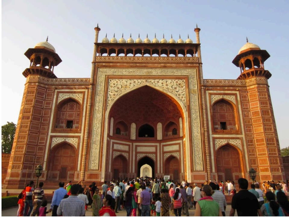
Entrance gate to the Taj Mahal

I was looking forward to seeing the different angles of the Taj Mahal - it seemed like the only view people ever saw was the front-on shot with the symmetry of the reflecting pool and rows of trees on both sides. We got our obligatory photos in front before pressing on forward. The main difference in the photo in real life was the enormous crowds of people all around on the paths on both sides and on the main plinth of the main structure. I wonder if on all the postcards they just photoshopped out all the people, or they scheduled a 1-hour closure of the entire Taj Mahal to the public, only allowing access to photographers with special VIP permits to line up and take photos... Even though our pictures were cluttered with people, and some of the trees were slightly uneven on both sides, it added an authenticity to the experience that wasn't there in the postcards.