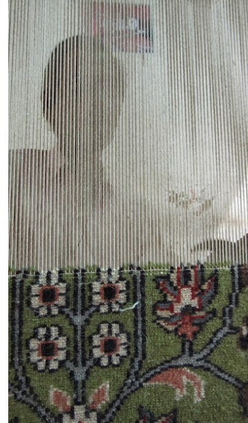
Rug being made

These designs would be outsourced to women in the surrounding villages where they could work at home, weaving the rugs stitch by stitch according to the design. A typical rug 6 feet wide by 8 feet long could take a half a year to weave. Outside the shop, they had a sample loom set up where they were about 1/3 of the way through a rug. The yarn would be passed through a set of 3 threads, and then cut to make a stitch. A whole row of stitches would be set before the weaver would push the stitches down to compress the row with the previous row. Then the threads would be reversed with a switch on the top of the loom, sort of like an enormous pedal harp. They would continue until the entire rug was set, all 700,000 stitches of it.