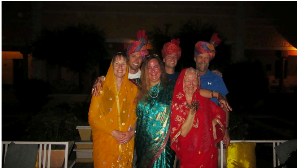
Turbans, saris and henna

could - we would be up early and would need our energy as an even bigger day was on tap for tomorrow.