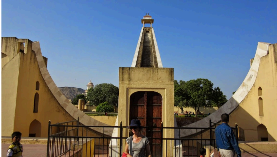
Samrat Yantra sundial in Jantar Mantar

the place years ago when one of my Indian coworkers visited. He showed pictures of a bunch of mysterious “stairways to heaven” pointing in all different directions. With proper reading, they could tell time with a precision of several seconds as well as predict solar and lunar eclipses for decades. The timing of the monsoon was important for centuries and telling time was a priority for farmers to know when to plant their crops. I was excited that Jantar Mantar was indeed on our tour. We didn’t have time to visit the smaller version of Jantar Mantar in Delhi, but we wouldn’t be disappointed in Jaipur.