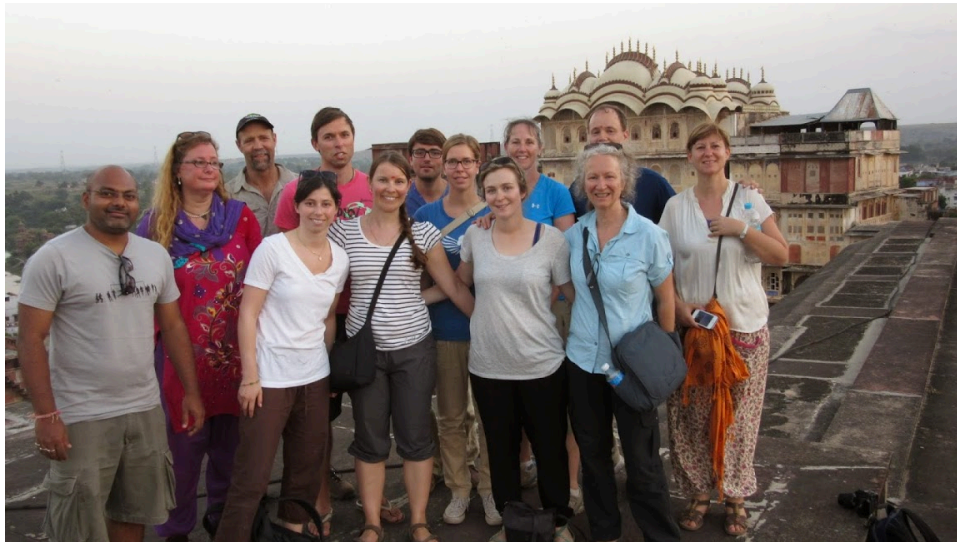
Our group in Karauli on the tour