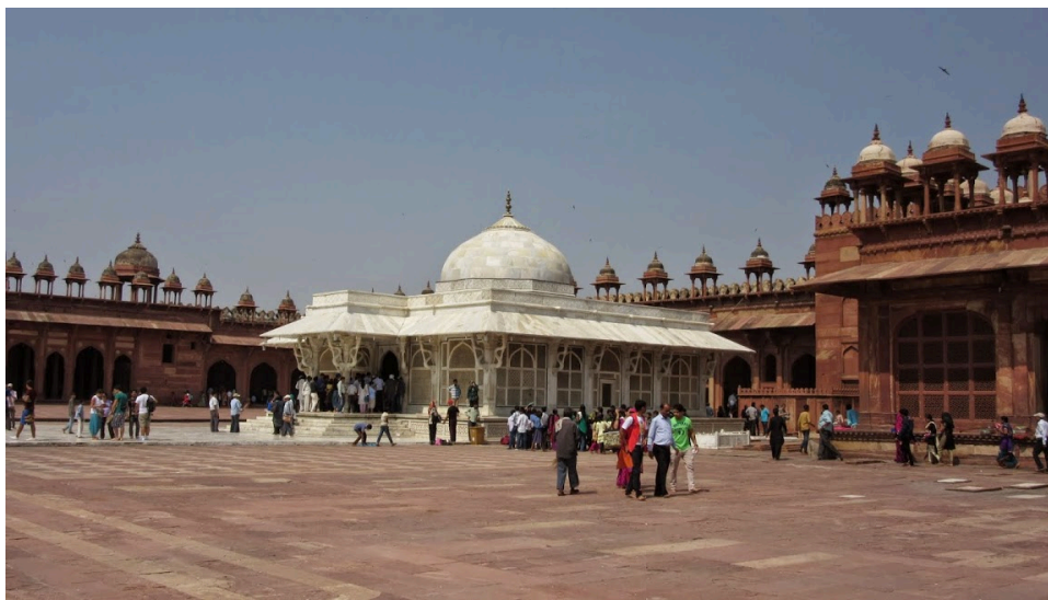
Tomb inside the mosque