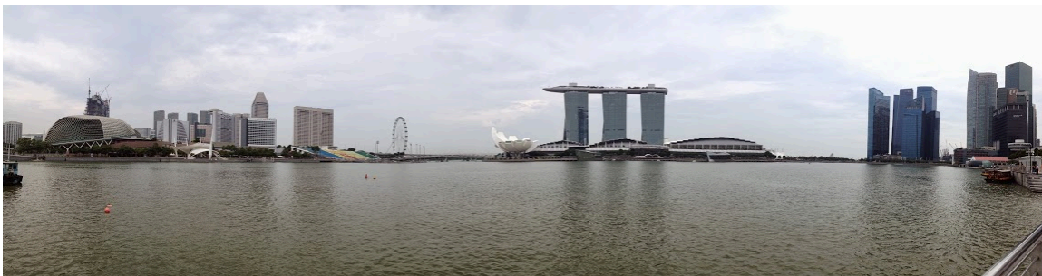
Panoramic view in Singapore